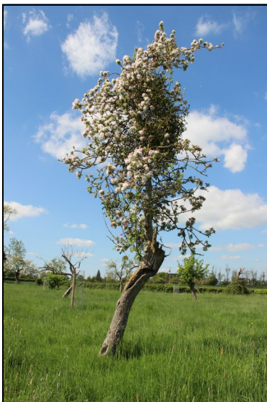
5. A newly pruned mature tree in blossom, May 2016