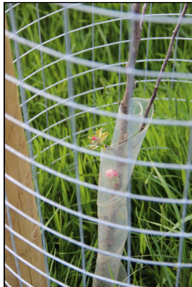
6. Blossom on one of the new cider trees, May 2016