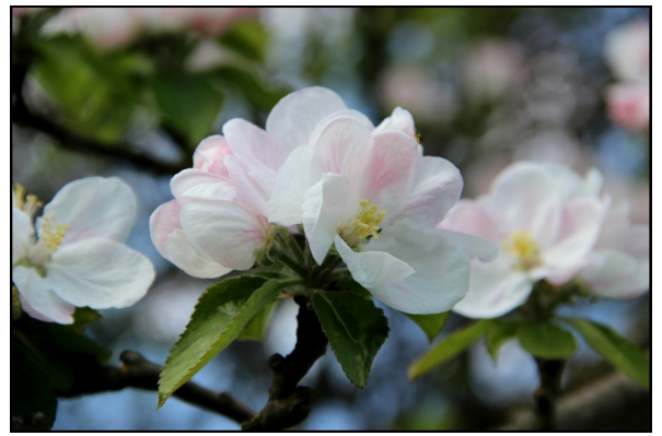
4. Apple blossom on one of the newly pruned mature trees, May 2016