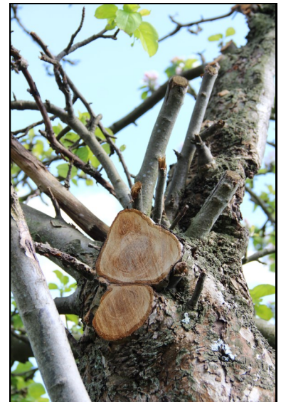
7. Pruned branches on one of the mature trees, May 2016