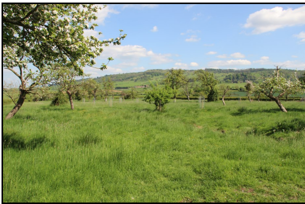
3. Breddy Croft Orchard in flower, May 2016