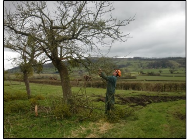
2. Contractor Jim Aplin pruning one of the old apple trees, March 2016